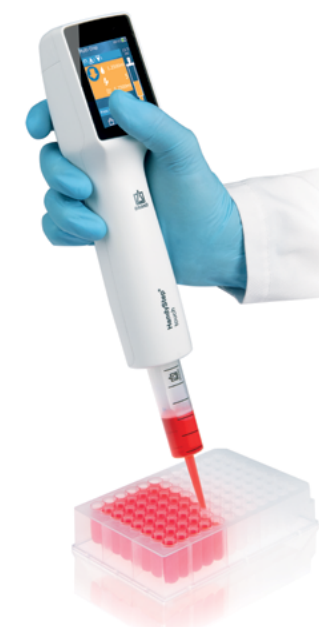
Multi dispensing with the HandyStep® touch and PD-Tip™ //

The HandyStep® touch saves time and prevents errors through automatic tip size recognition of the PD-Tip™ // from BRAND®, with patented coding on the pistons. After inserting the tip, the size is automatically recognized and displayed, making it easy to select the volume to be dispensed. When a new PD-Tip™ // of the same size is inserted, all instrument settings are maintained.