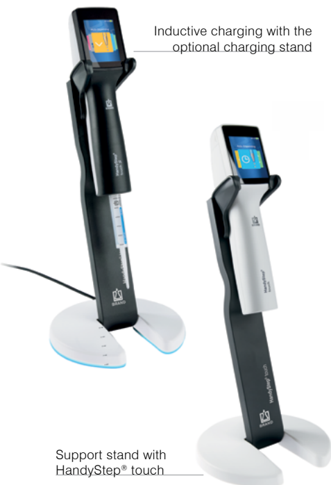
Inductive charging with the optional charging stand