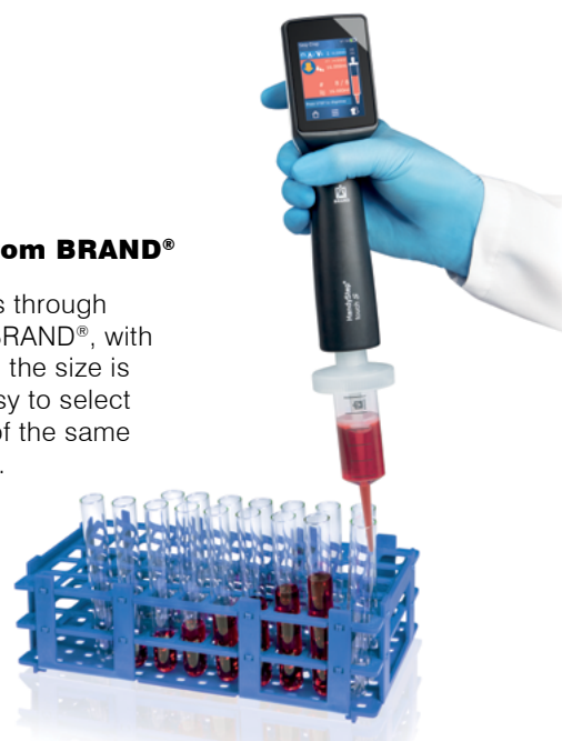
Sequential dispensing with the HandyStep® touch S and PD-Tip™ //