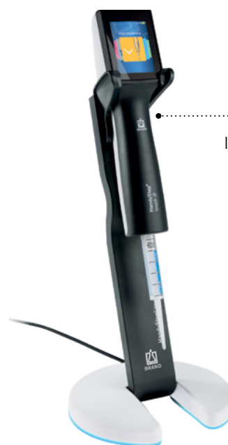
Charging stand with HandyStep® touch S and PD-Tip™ II

Inductive charging with the optional charging stand